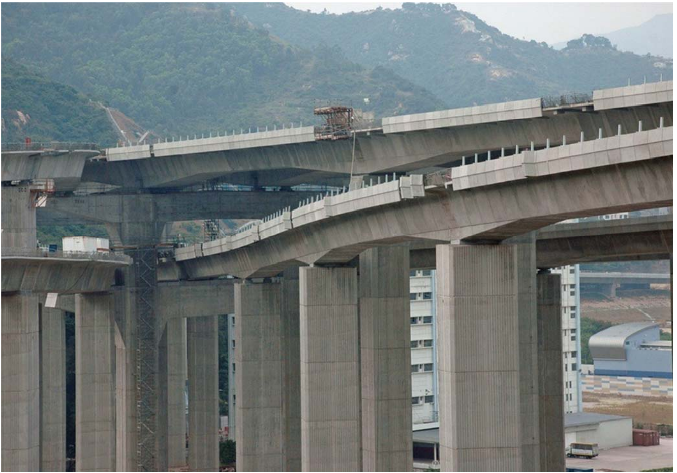
Ngau Shuen Chau and Lai Chi Kok Interchange