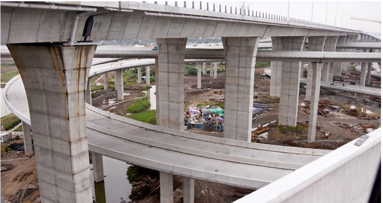
Some views of the interchanging slide-ways