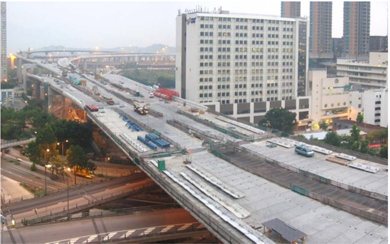
Ching Cheung Road Interchange and Butterfly Village carriageway