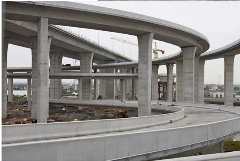
Some views of the interchanging slide-ways

In the following slides you can see the interchange network of the Hong Kong Route 8 projects at various locations