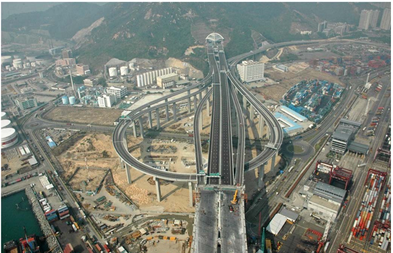
The Tsing Yi South Interchange connecting the Stonecutters Bridge, Nam Wan Tunnel and the Container Terminal No. 9 at Tsing Yi