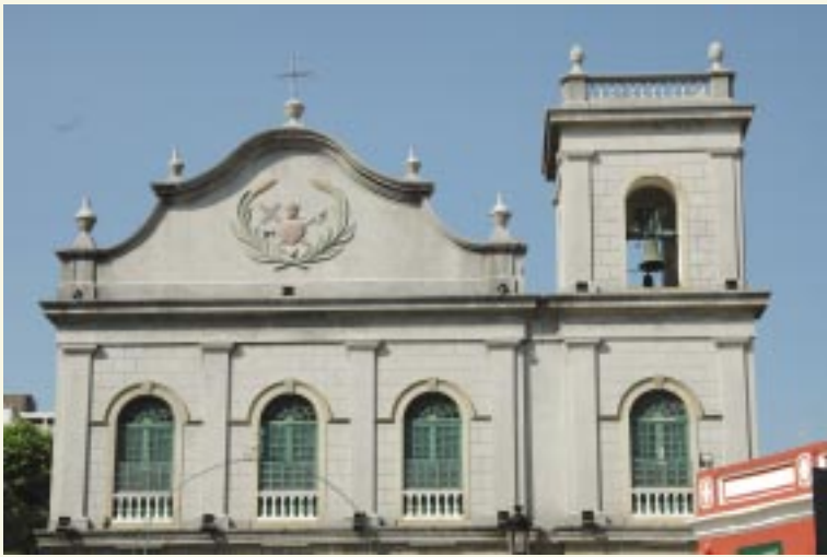
The front marble facade of St Anthony's Church near the Camoes Park