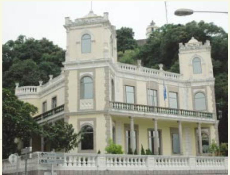
An unnoticed classical building to most tourists located on the mid-level near the Guia Fortress. The Guia Lighthouse can just be seen on the right upper corner