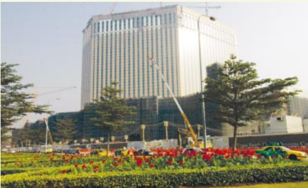
The exterior view of the Venetian Macau, a 40-storey structure with casino resort and hotel facilities giving a serviceable area of more than 300,000 sq m. The complex is located along the Cotai Strip, a 1.8 km-long reclaimed land area adjoining the Taipa and Coloane islands of Macau