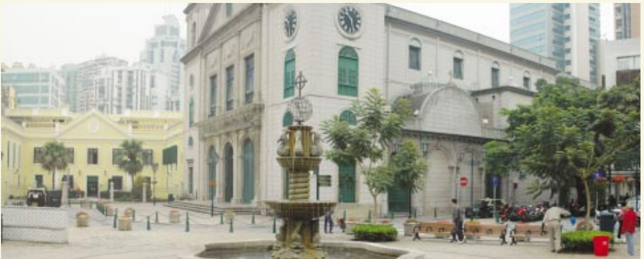
A public square outside the St Dominic's Church with fountain and sitting out space, forms a typical townscape that can be found everywhere in European township