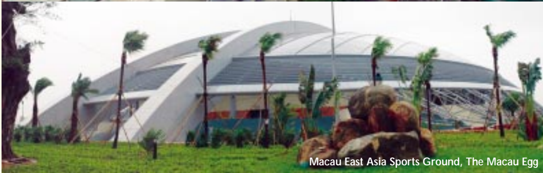
Macau East Asia Sports Ground, The Macau Egg

Sport facilities in Macau mainly located in the Taipa Island