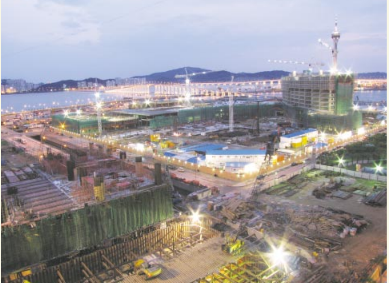
The commencement of one of the key-turning projects of Macau's gaming industry - construction of the Wynn Resorts at its early stage as seen in 2004