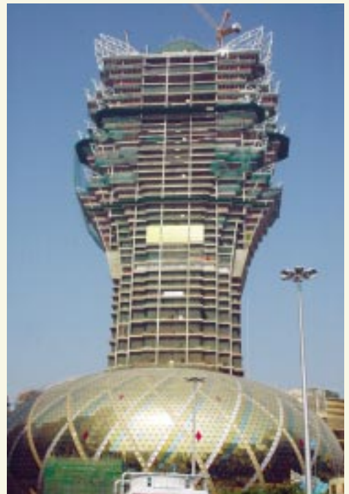
Casino Lisboa, tycoon of the Macau gaming industry, has a new resort complex with casino and hotel under construction ready for opening in mid 2007