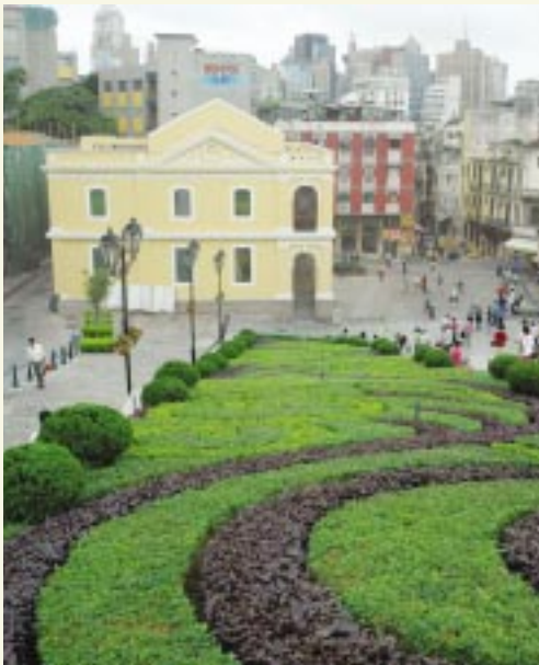
The green strip and open area in front of the Ruins of St Paul's