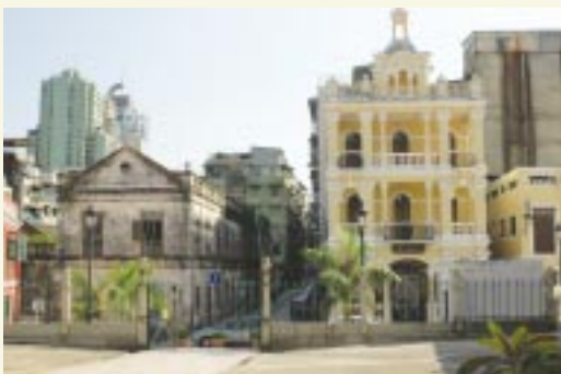
Side streets near the Tap Seac Square that can hardly recall tourists' orientation inside an Asian city