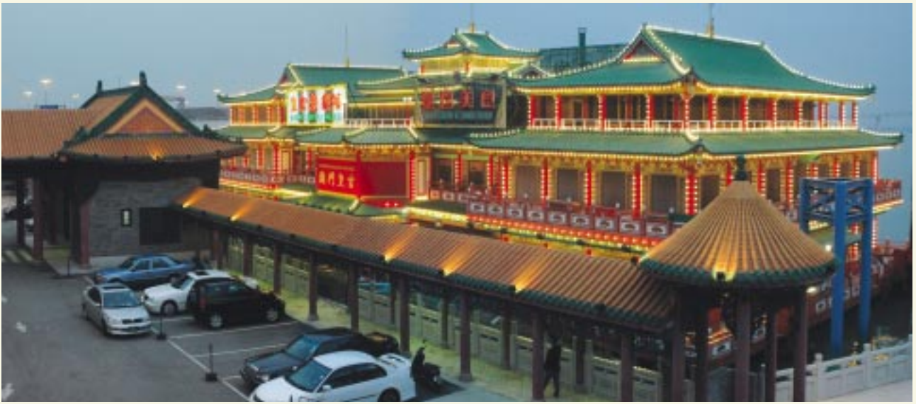
The eye-catching neon-light signage at the front of each casino performing its symbolic light show at night