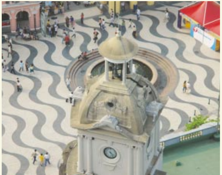
A bird's eye view of the Senado Square with the Bell Tower of the Post Museum as the foreground