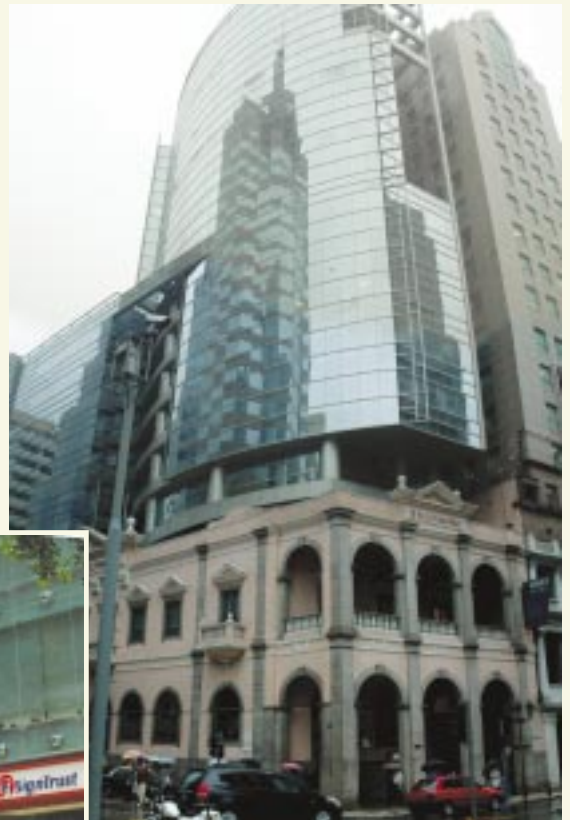
Redeveloped property with the facade of the original building being preserved and a new structure integrated behind it forming an interesting design