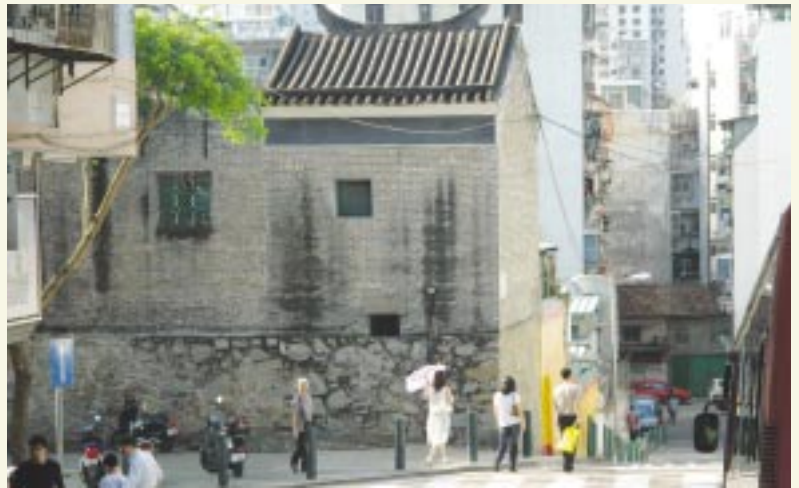
Classical buildings with strong Chinese traditional taste that merged harmony inside the old city