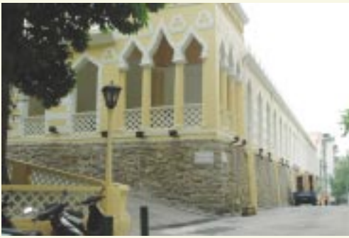
The Moorish Barracks, a neo-classical structure listed in the Macau World Cultural Heritage, is within 5-minute walking distance from the A-Ma Temple