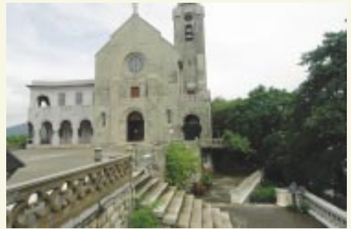
The Bishop Church and its terrace garden overseeing the Sai Van Lake