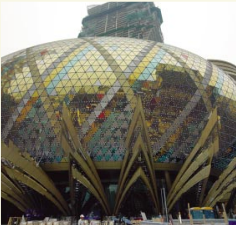
An eye-catching design feature of the New Casino Lisboa, an approximately 120m deformed sphere which housed the 4-level casino inside