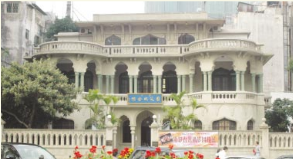
The Memorial Hall for Sun Yat Sen, one of a very modest architecture with delicately mixed style not formally listed in the Macau World Cultural Heritage